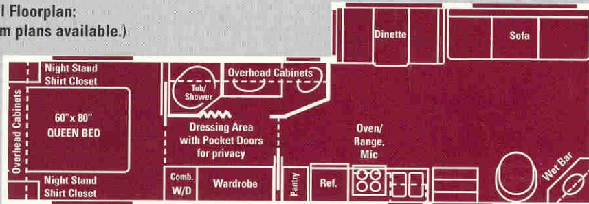
Typical Floorplan: (Custom plans available.)

At day's end, retire in style to Grizzly's spacious bedroom with mirror accent and ample closet storage. Climb into the queen bed to relax, watch TV or drift to sleep listening to your favorite tunes on the 100-watt per channel surround sound system. Super deep tint windows mean maximum privacy.